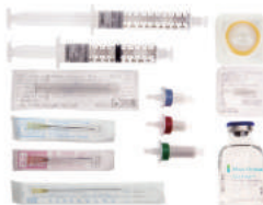
Ancillaries Set | AS-209