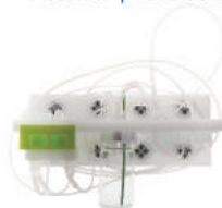
Cassette | SYFR