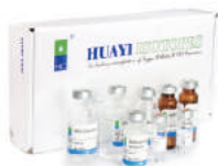
Reagents Kit | RK-209